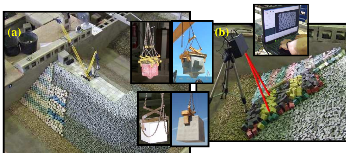
Figure 2. 3D placement tests: (a) small scale crawler crane and (b) laser scanning of CAUs

It is known that cube CAUs randomly placed on a slope tend to face parallel to the slope and fit face-to-face with other cubes. In order to measure armor unit randomness, cube and Cubipod CAUs were characterized by the position of the center of gravity and three orthogonal vectors for 3D orientation. The laser scanner (0.1 mm precision), shown in Fig. 2b, was used to scan armor layers with D_{n50}[\text{mm}]=40 CAUs. The Armor Randomness Index (ARI) was defined as the average of three percentile ratios (10%, 50% and 90%) of the cumulative distribution of the minimum 3D angle between neighboring CAUs when compared to true random 3D orientation. Measured ARIs were much higher for Cubipods than conventional cubes ( \text{ARI}[\text{Cubipod}]\approx 90\% > \text{ARI}[\text{cube}]\approx 60\% ) when placed with scaled crawler cranes as shown in Fig. 2a.